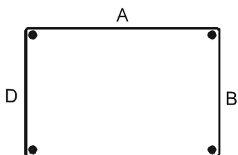
C Flangia cieca - Flangia di accoppiamento Blind flange - Connection flange